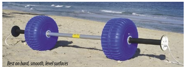
Best on hard, smooth, level surfaces