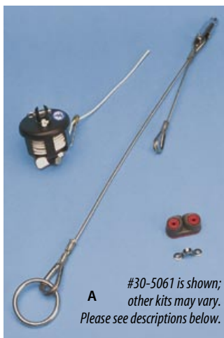
#30-5061 is shown; other kits may vary. Please see descriptions below.