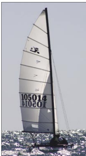
Pinata Regatta 2006

For attaching Nacra jib tack. 2-3/4" long with 1/4" pin diameter. SWL 800 lbs. 22-4501 $39.00