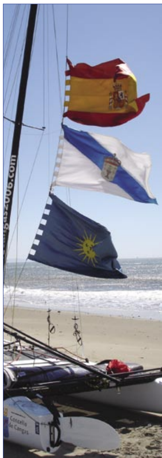
2005 Hobie Tiger Worlds