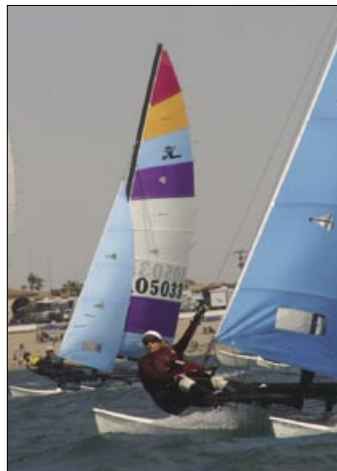
Piñata Regatta 2007