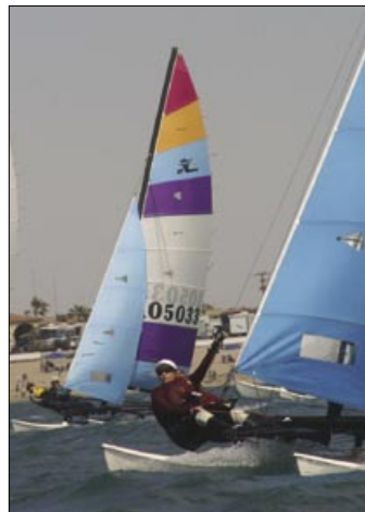
Piñata Regatta 2007