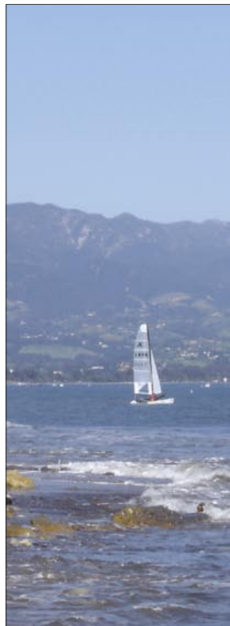
Hobie Tiger Worlds 2005, Santa Barbara, CA