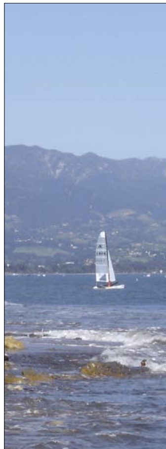
Hobie Tiger Worlds 2005, Santa Barbara, CA