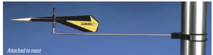
Attached to mast