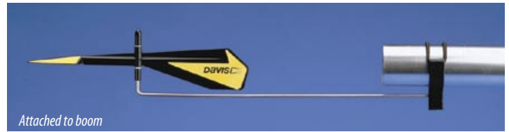
Attached to boom