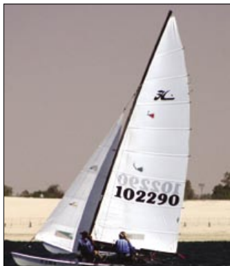
Pinata Regatta 2006