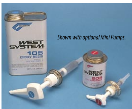
Shown with optional Mini Pumps.