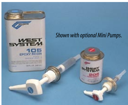
Shown with optional Mini Pumps.