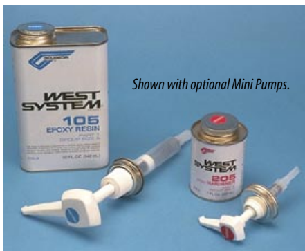
Shown with optional Mini Pumps.